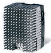
Decentralised drive technology