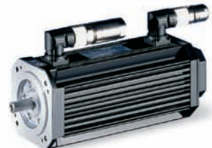
Standard three-phase AC motors, synchronous and asynchronous servo motors