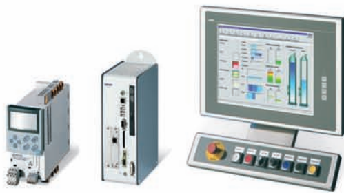
Controls and industrial PCs